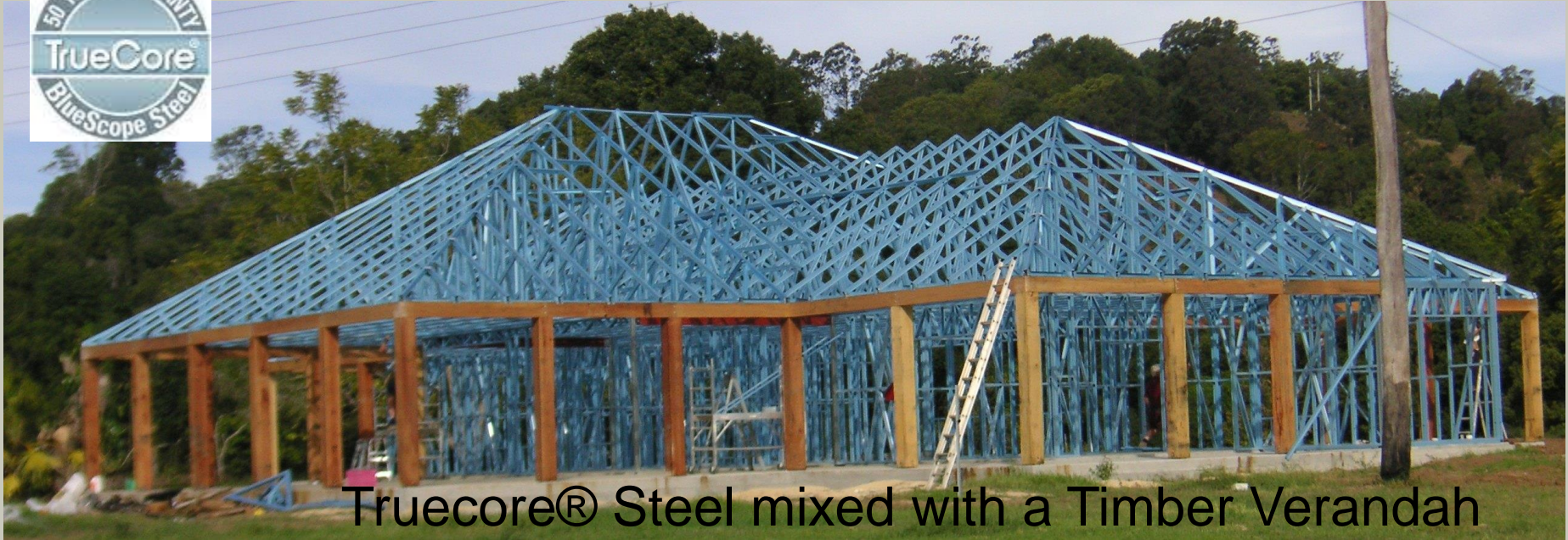
Truecore® Steel mixed with a Timber Verandah