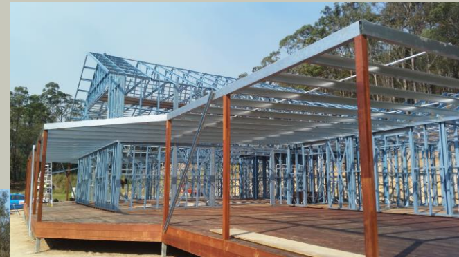
Large Home with a Mans Cave